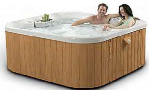
Spa model not exactly as shown

Tickets go on sale at the Port Dalhousie PigNc August 20, 2006. Buy early and buy often!